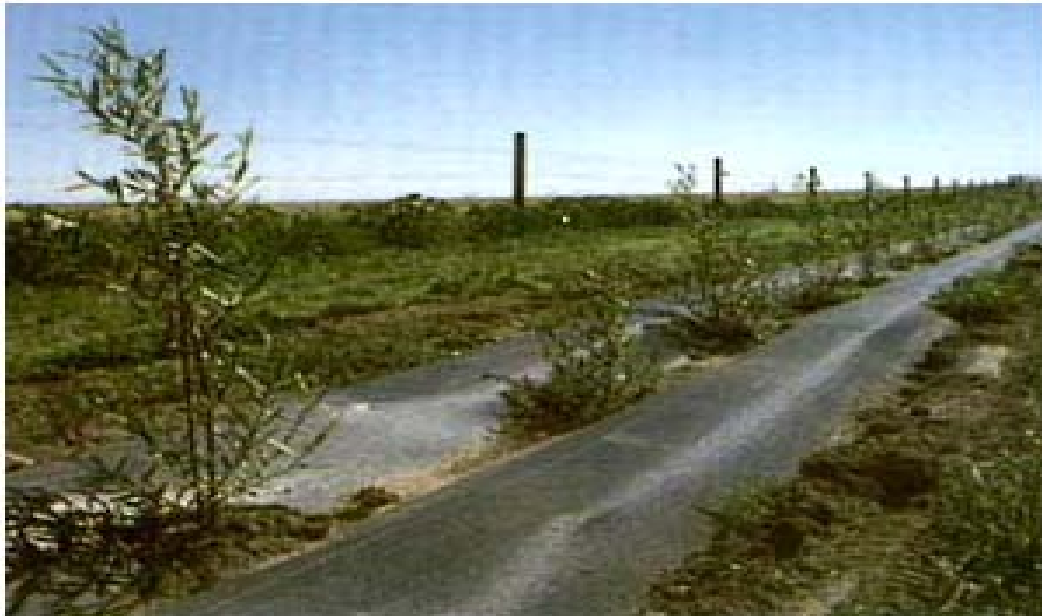
Figure 3. Example of Option 1 - Anchoring Six-Foot Wide Continuous Fabric Mulch Using Soil along the Edges