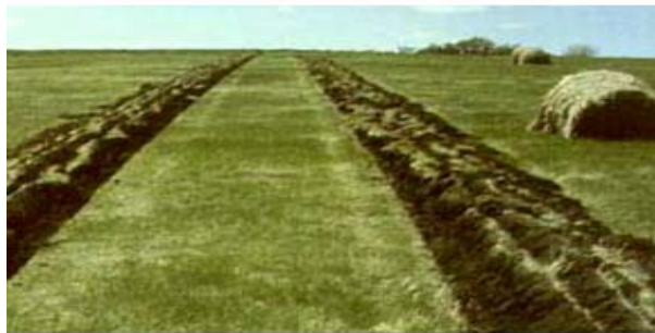
Figure 1. Strip Tillage on Native Sod