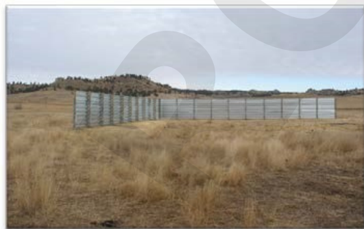
Figure 2. Typical Wind Shelter Structure

Locate the shelter on level, uninterrupted terrain, if possible. If the shelter must be located downwind of a hill, place the shelter as far downwind as possible. A shelter upwind of a hill shall be placed a minimum of 75 times the shelter height upwind of the base of the hill.