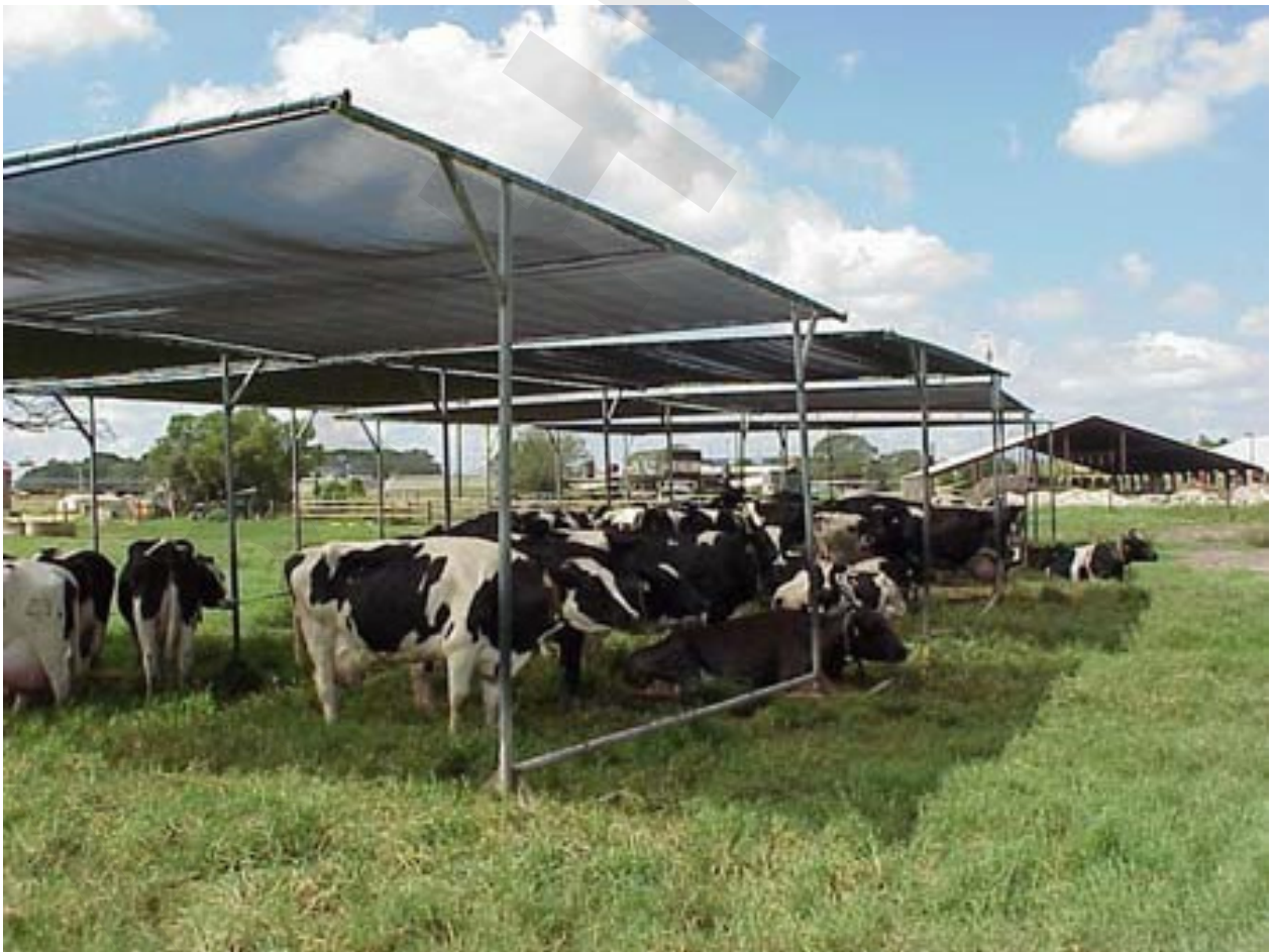
Figure 1 – Typical Shade Structure

When the livestock protection structure is installed to improve livestock distribution to address resource concerns, then NRCS CPS Prescribed Grazing (Code 528) must also be included in the resource management plan.