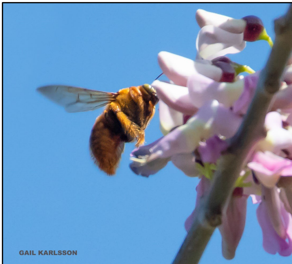
Photo 1. Male Caribbean Carpenter bee (Xylocopa mordax). Photo taken by Gail Karlsson at USVI.

Establishing wildlife habitat by planting herbaceous vegetation or shrubs.