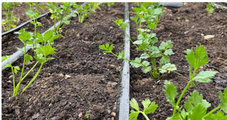
Drip irrigation and cilantro transplants.

Irrigation water quality directly affects crops, soils and the environment. Testing irrigation water can help prevent potential adverse impacts by properly treating the water prior to application.