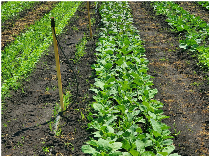
Mini-wobbler irrigation system.

energy saving versus conventional methods. It is the responsibility of organic producers to ensure that all permissible activities, design, materials used, and material specifications are consistent with the USDA National Organic Program.