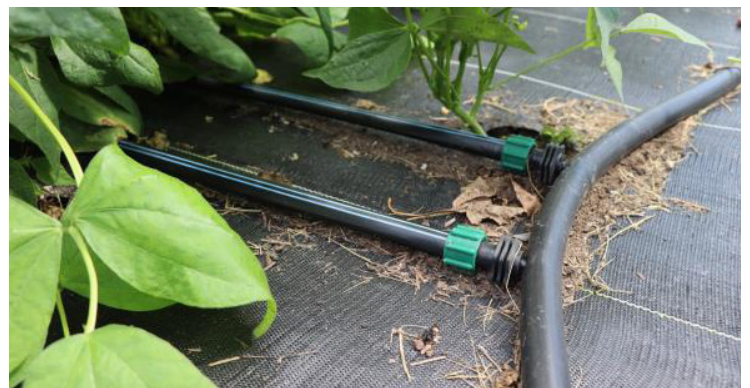
Drip irrigation under beans.

Commercial landscaping fabric is often used on farms for weed control. It is permeable yet can partially obstruct rain or irrigation water. Lay landscaping fabric over moist soil. Lay drip tape under the fabric for the best direct application of water to the soil surface.