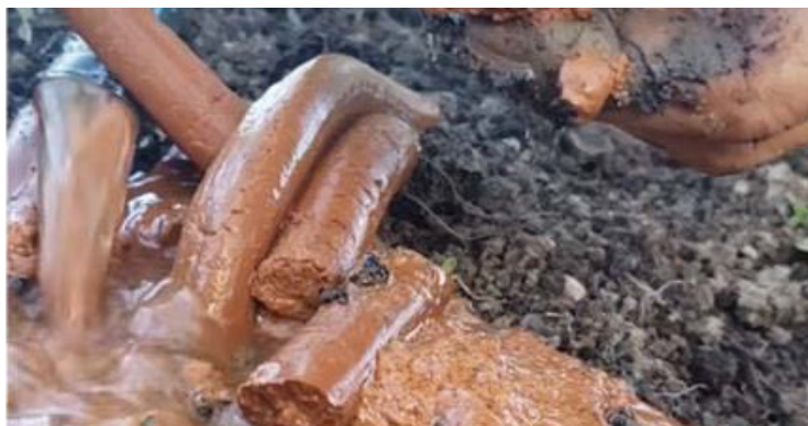
Clogged drip tape from unfiltered well water.

Adequate crop rotation is important to prevent disease and pest pressure.