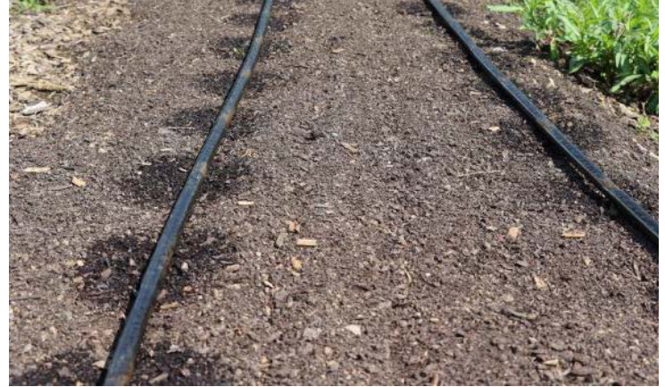
Drip tape irrigation on crop growing beds

Irrigation Scheduling determines when to irrigate and how much water to apply during each application. Application amount, rate, and timing are scheduled to replace soil moisture used by the crop, allowing sufficient capacity for storage of additional moisture from effective precipitation. Base the timing of irrigation on one or more of the following methods: