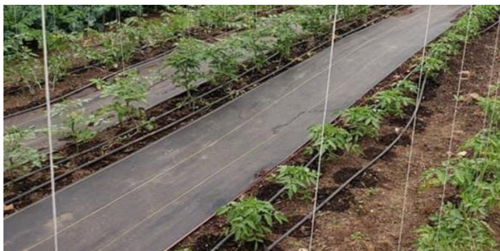
Drip irrigation on transplanted crops.