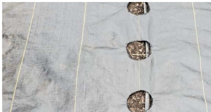
Drip irrigation tape under landscaping fabric.

The use of energy saving technologies, such as low energy precision application irrigation and use of alternative energy sources can result in significant