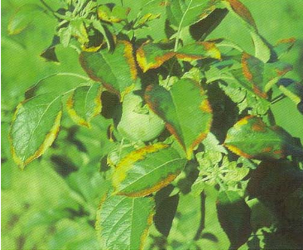
Plate 4. K-deficient apple showing necrosis (scorching) of leaf margins.