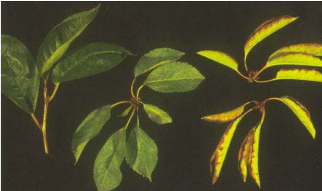
Plate 6. K-deficient sour cherry (right): marginal necrosis and leaf curling.