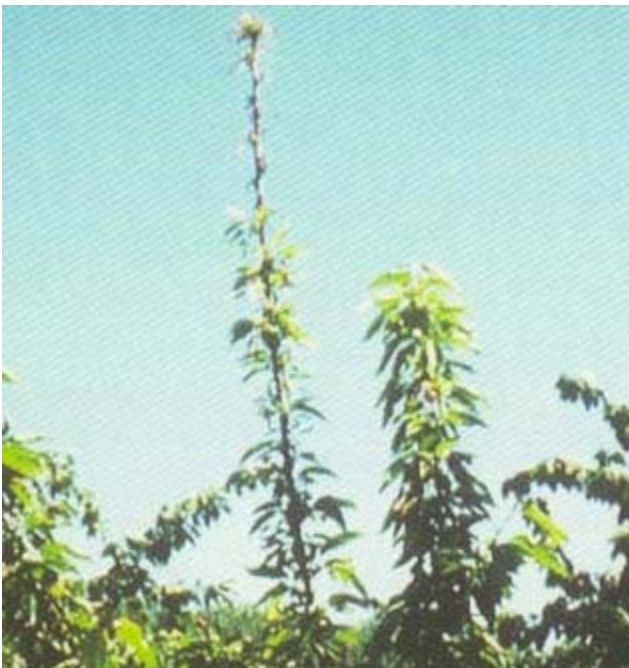
Plate 10. B-deficient cherry showing dieback of shoot terminals.