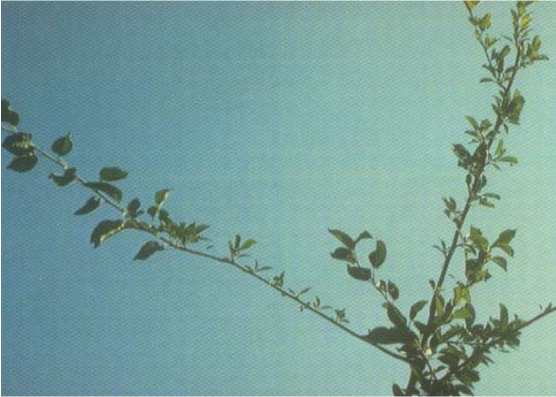
Plate 18. Zn-deficient apple showing "blind wood" where buds on the previous season's wood fail to break or exhibit weak growth.