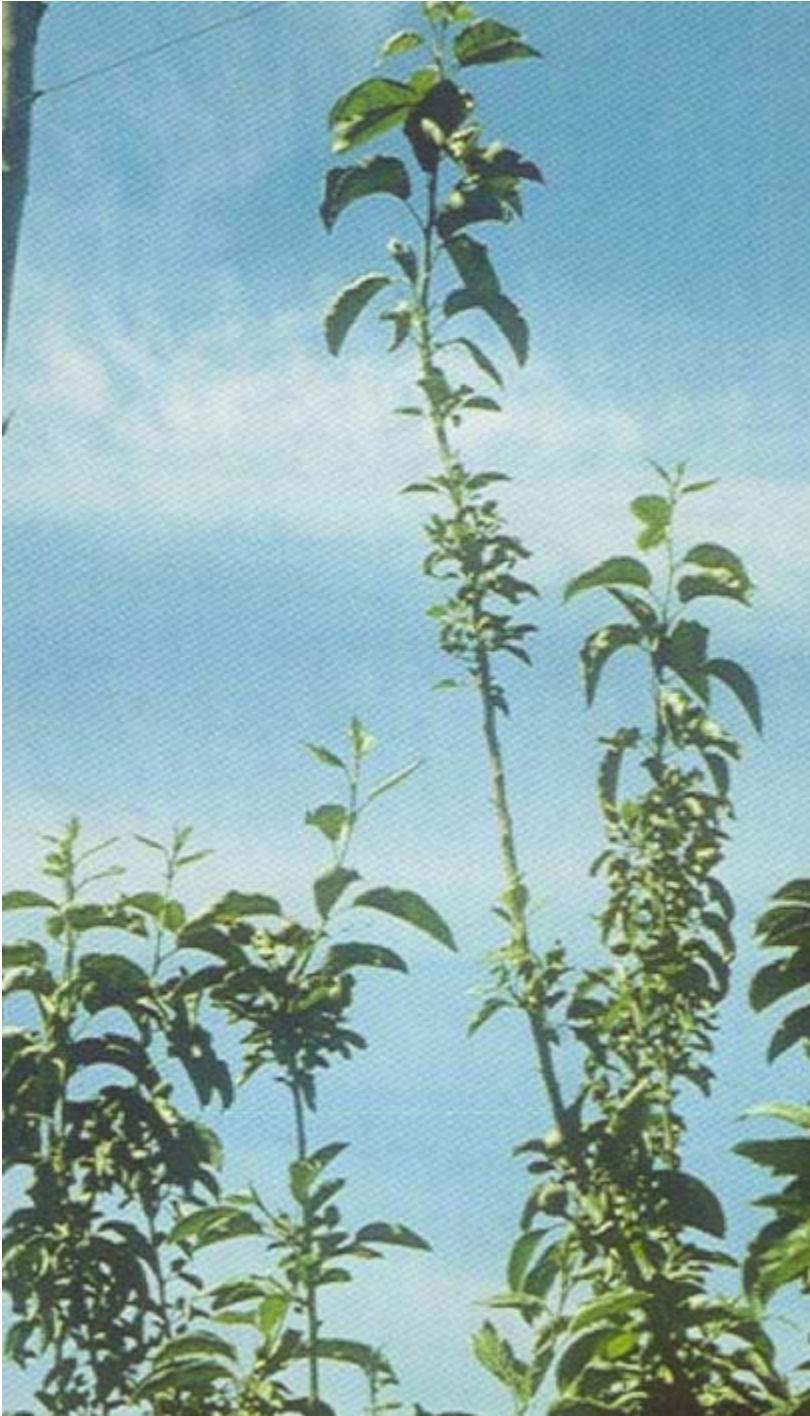
Plate 19. Zn-deficient apple: rosette of growth due to limited extension growth, and small leaves on the previous season's wood.