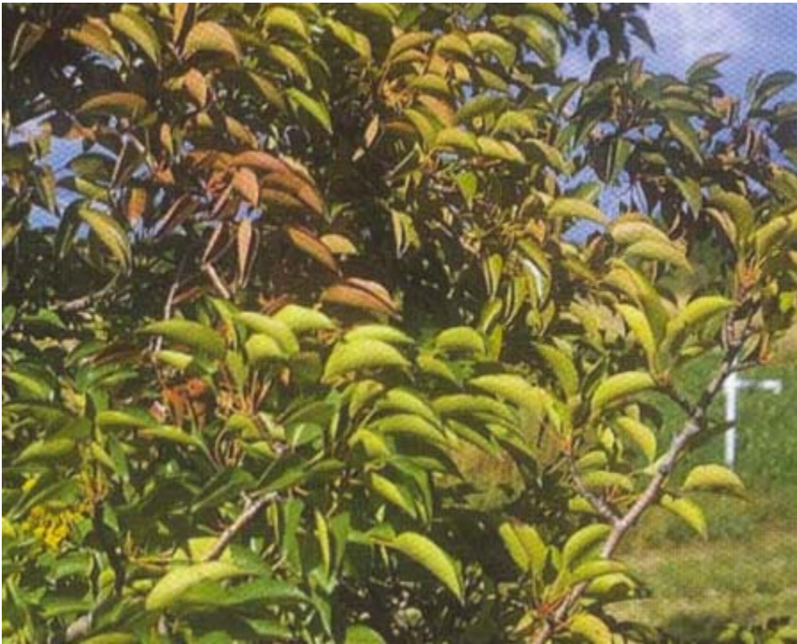
Plate 2. N-deficient pear: pale green to bronze leaves, limited growth.