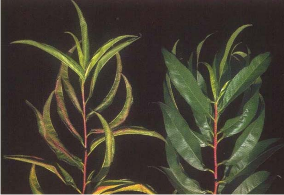
Plate 5. K-deficient peach shoot (left): marginal necrosis and leaf curling.