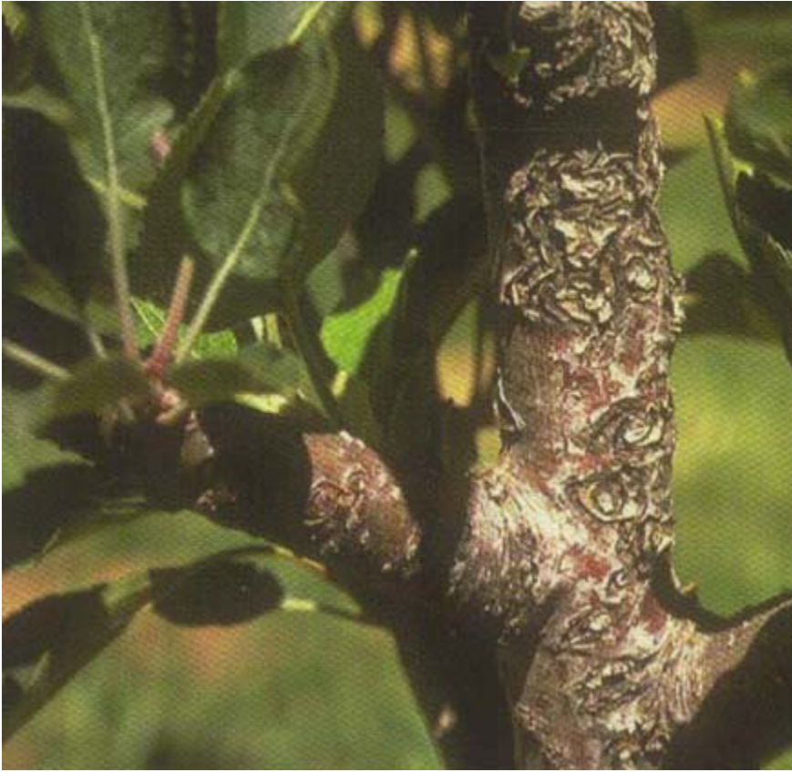
Plate 17. Mn toxicity on apple: "measles" or necrosis of the bark cambium on younger stems.