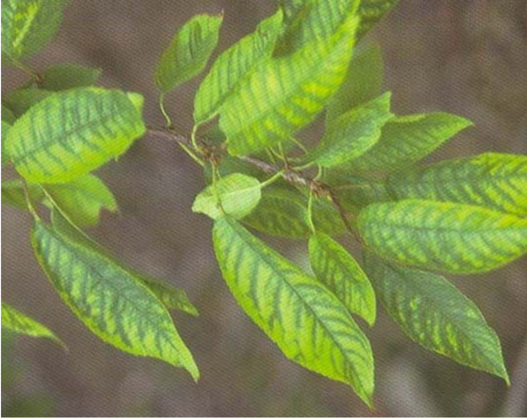
Plate 16. Mn-deficient sweet cherry showing interveinal chlorosis.