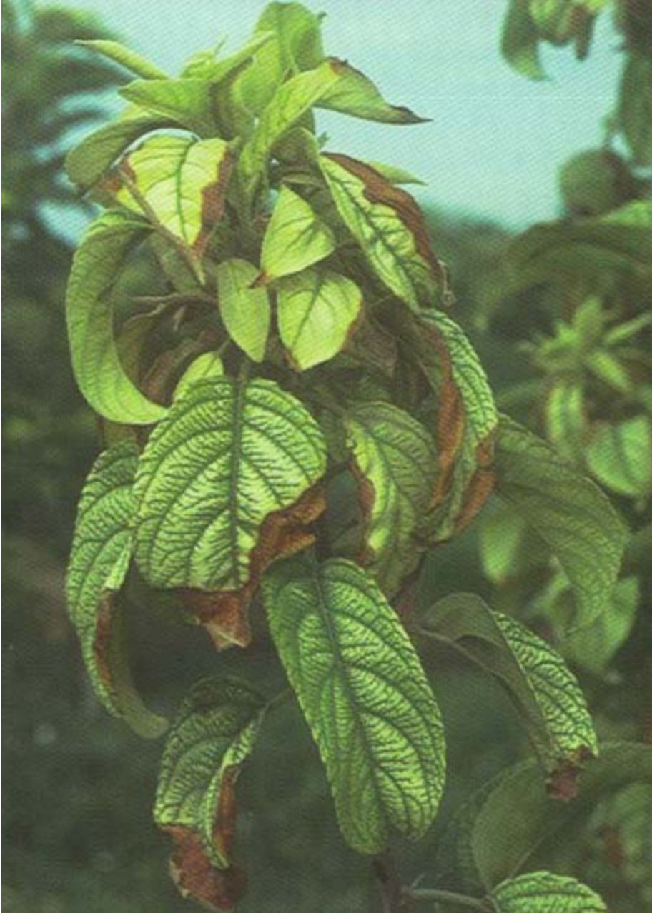
Plate 14. Fe-deficient apple: interveinal chlorosis with leaves at shoot tips most affected.