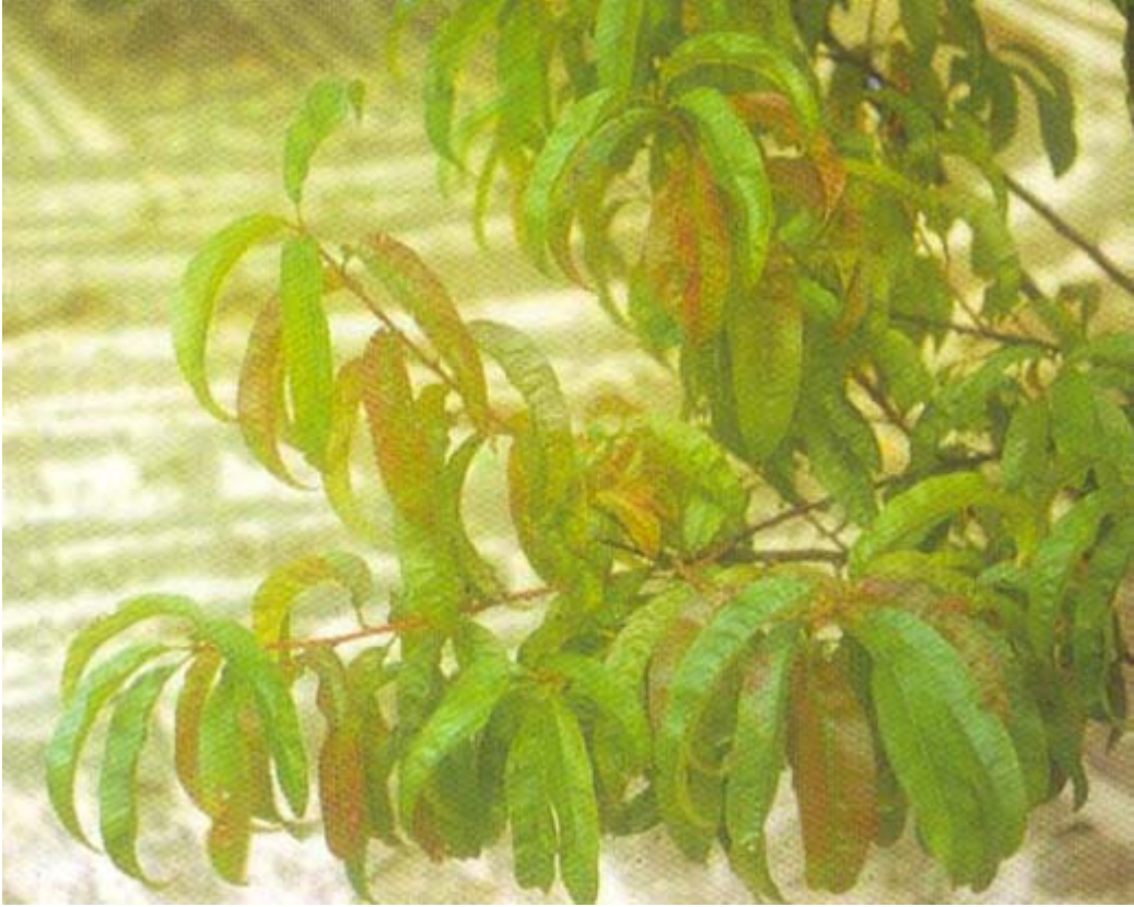
Plate 3. N-deficient peach: pale green-red chlorosis.