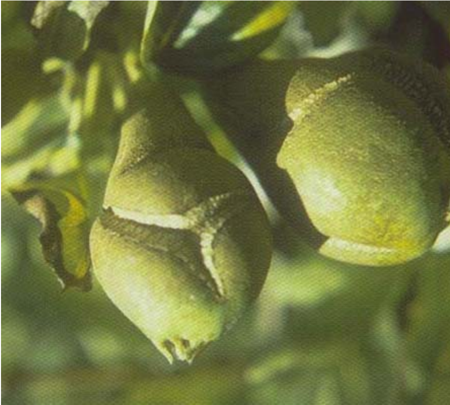
Plate 13. B-deficient pear fruit showing severe cracking.