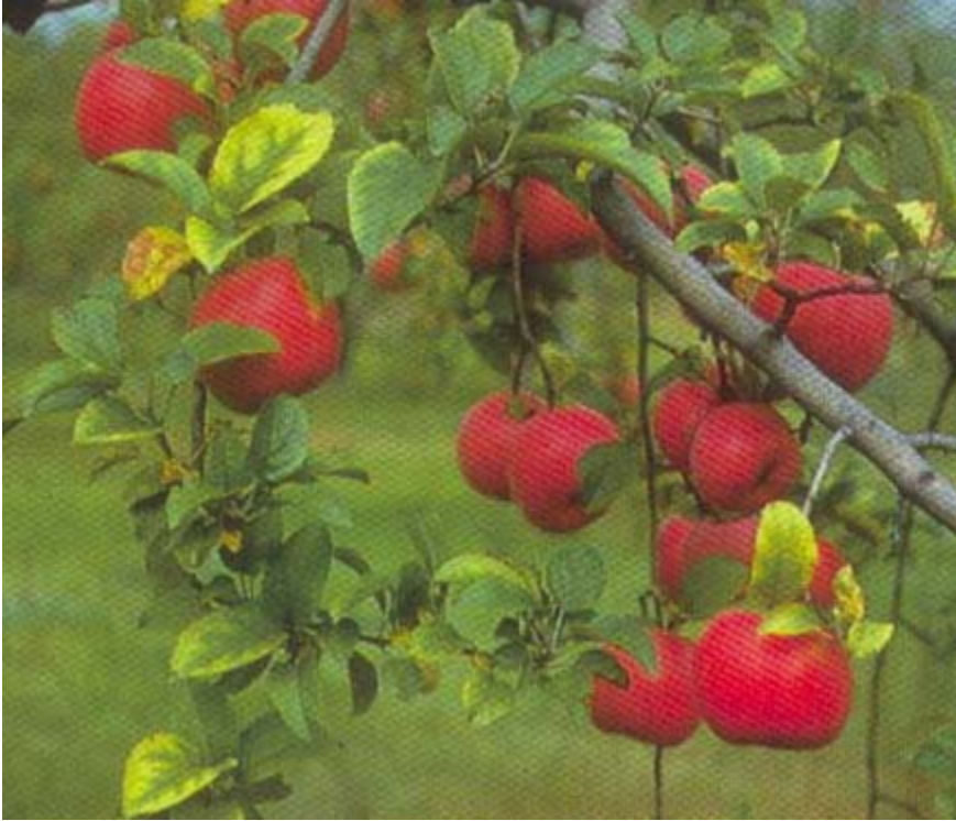
Plate 7. Mg-deficient apple: chlorosis between the main veins.