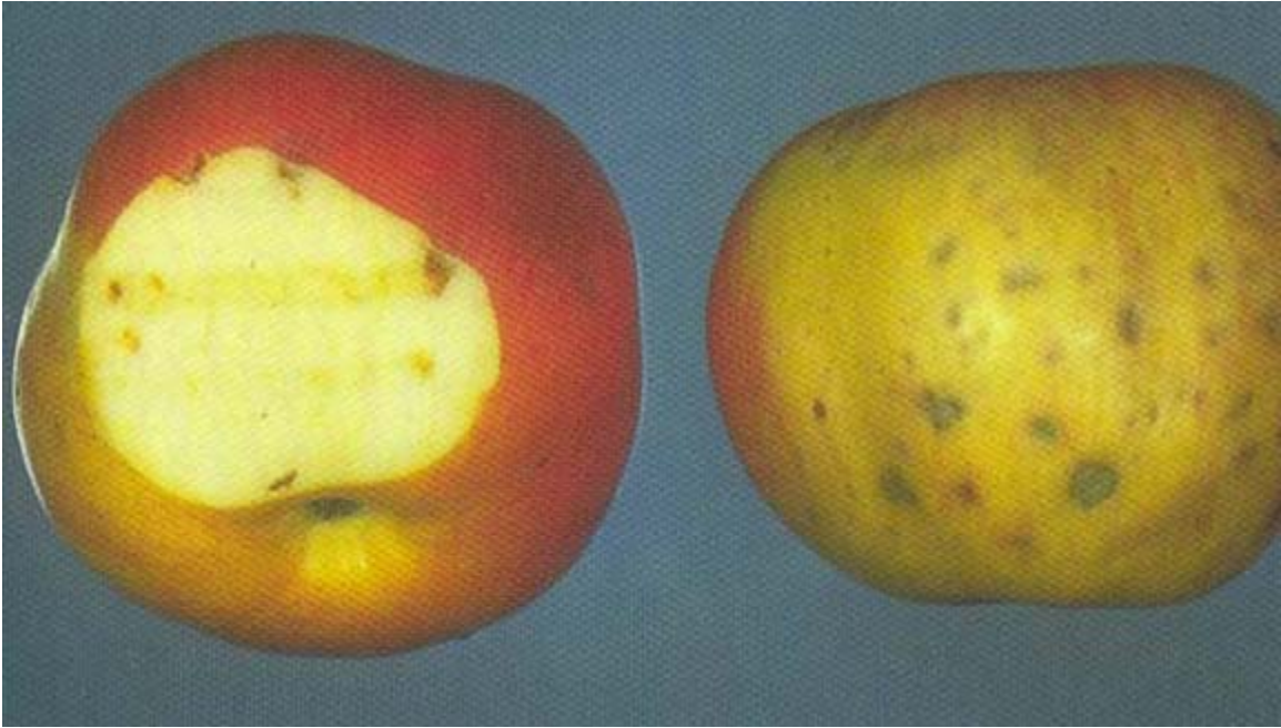
Plate 9. Ca-deficiency in apple fruit causes "bitter pit" necrotic lesions just under the skin.