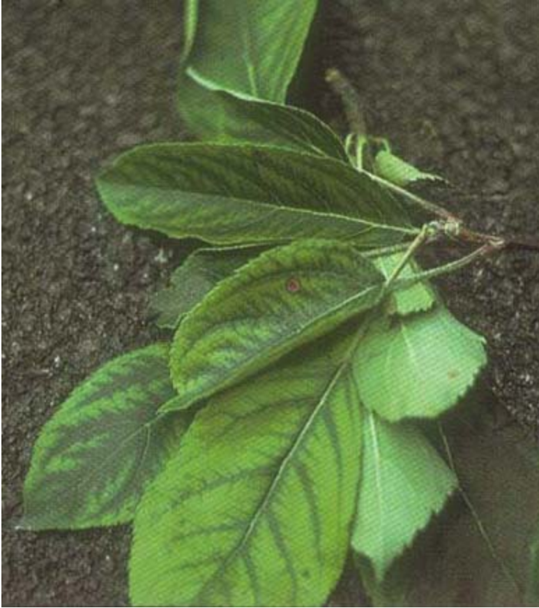
Plate 15. Mn-deficient apple: interveinal chlorosis.