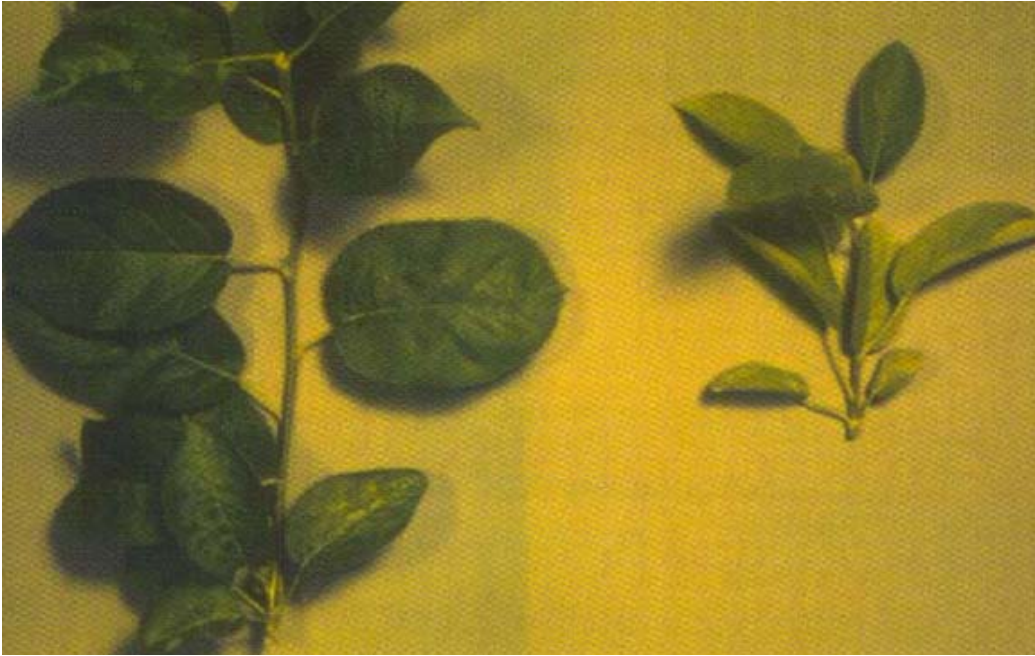
Plate 1. N-deficient apple shoot (right): small, pale green leaves, little extension growth.