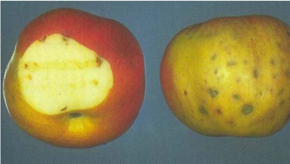
Plate 9. Ca-deficiency in apple fruit causes "bitter pit" necrotic lesions just under the skin.