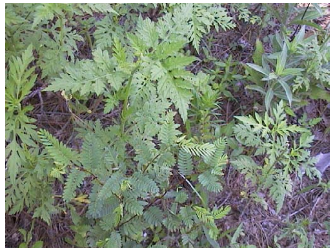
Light disking favors seed producing plants.