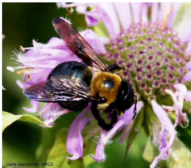
Carpenter bee on bergamot

Keep in mind that small bees may only fly a couple hundred meters, while large bees, such as bumble bees, easily forage a mile or more from their nest. Therefore, taken together, a diversity of flowering crops, wild plants on field margins, and plants up to a half mile away on adjacent land can provide the sequentially blooming supply of flowers necessary to support a resident population of pollinators.