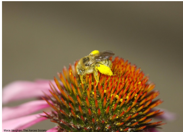
Native bee on purple coneflower.

The plants suggested below are all commonly available garden plants. These species will generally do best in a full sun location and may require supplemental irrigation and fertilization. Establishment of perennial plants may take a few years, but they will often last for an extended period of time. One strategy is to plant annual and perennial garden plants together, with the annual plants providing immediate benefits the first year, while the perennial plants become established.