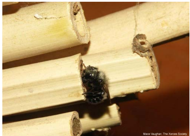
A mason bee closing the entrance to her nest with mud after laying a series of eggs in the tube.

While in most cases native plants are preferred, non-native ones may be suitable for some applications, such as annual cover crops, buffers between crop fields and adjacent native plantings, or short-term low cost insectary plantings that also attract beneficial insects which predate or parasitize crop pests. For more information on suitable non-native plants for pollinators, see the tables 3 and 4.