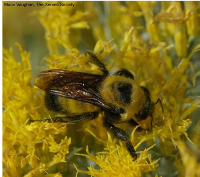
Bumblebee on goldenrod

Habitat enhancement for native pollinators on farms, especially with native plants, provides multiple benefits. In addition to supporting