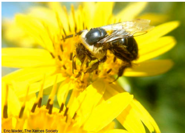
Sunflowers are a prolific summer bee plant for Illinois.

Similarly, is the new habitat located near existing pollinator populations that can “seed” the new area? For example, fallow areas, existing wildlands, or unmanaged landscapes can all make a good starting place for habitat enhancement. In some cases these areas may already have abundant nest sites, such as fallen trees or stable ground, but lack the floral resources to support a large pollinator population. Be aware of these existing habitats and consider improving them with additional pollinator plants or nesting sites.