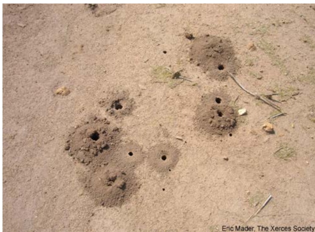
Entrances to these ground nesting bee nest resemble ant hills but have larger entrances.

Weed control alternatives to tillage include the use of selective crop herbicides, flame weeders, and hooded sprayers for between row herbicide applications.