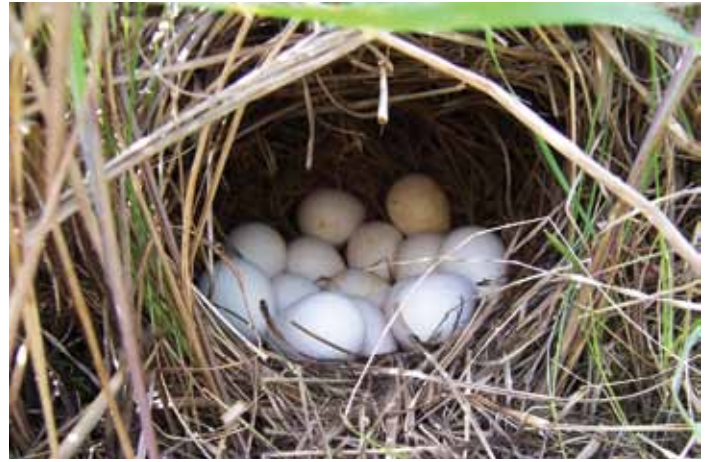
Figures 8a and 8b. Eastern meadowlark (left), northern bobwhite (right) and grasshopper sparrow all construct their nests on the ground. Nests are usually made of dead grass leaves from the previous year.

Duration of grazing is an important consideration for continued grass productivity as well as winter cover for migrating and wintering birds. Optimally, NWSG should not be grazed past early August to allow sufficient growth for winter cover. At this point, livestock grazing NWSG can be moved to CSG pasture that has rested through the summer.