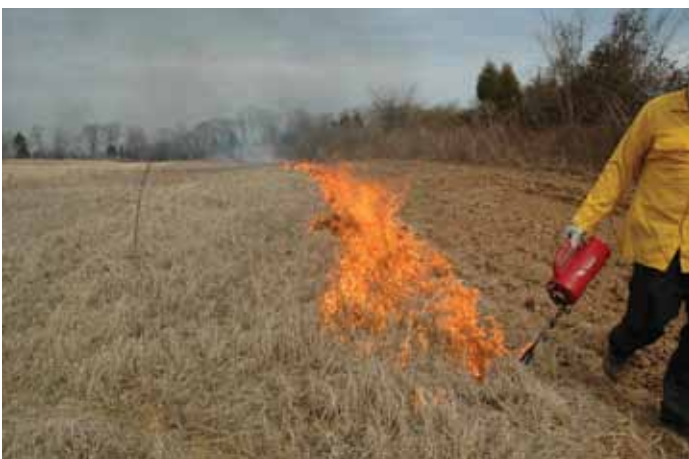
Figure 9. Prescribed fire rejuvenates NWSG growth and enhances the structure at ground level for several wildlife species, including northern bobwhite.

Prescribed fire is often used late in the dormant season (late March or early April in the Mid-South) to stimulate grass growth and improve forage quality in NWSG forage stands. Prescribed fire also removes accumulated dead plant material (litter) and creates more open conditions at the ground level, which is important for several wildlife species, including northern bobwhite, grasshopper sparrow, wild turkey and eastern cottontail.