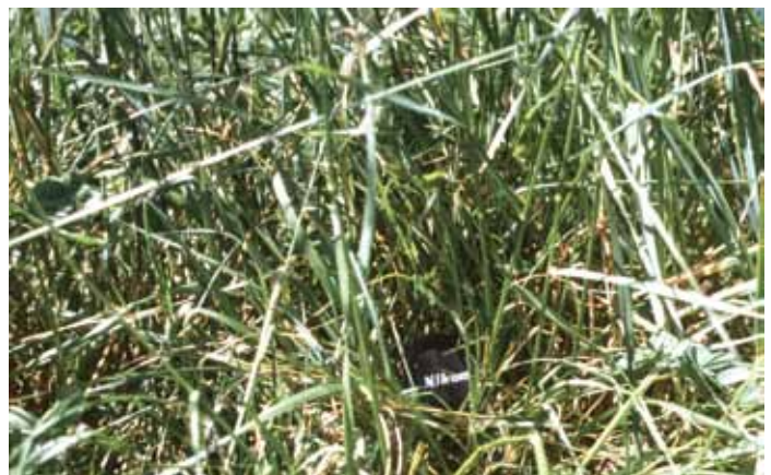
Figures 4a and 4b. Structure at ground level is a major consideration for several wildlife species, such as northern bobwhite. The open structure presented by NWSG (left) allows movement and feeding within the field, whereas the structure provided by tall fescue (right), orchardgrass and bermudagrass restricts use by many species.