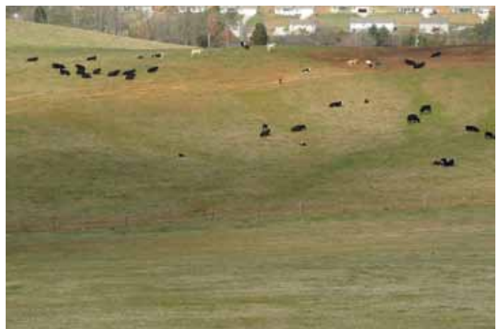
Figures 7a and 7b. NWSG grazed properly (left) look different than intensively grazed CSG (right), which are ubiquitous across the Mid-South region. Notice the height of the forage and the open space near ground level (in the photo on the left). This type of structure is critical if wildlife is a consideration. The presence of various forbs, such as red clover and ragweed, not only adds livestock forage value, but also enhances the structure and food availability for wildlife.