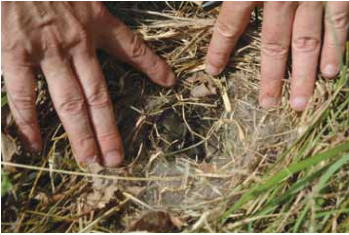
Figures 5a and 5b. Eastern cottontails may use NWSG hayfields for nesting (left) and winter cover (right), provided there is sufficient overhead cover.