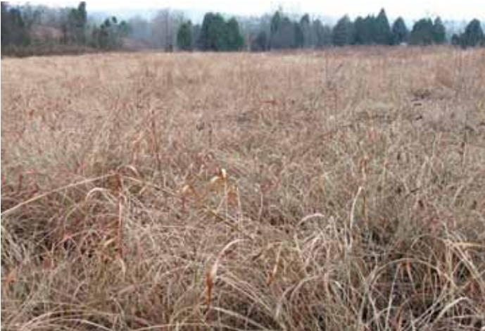
Figures 6a and 6b. The big bluestem/indiangrass field on the left was hayed twice with the second cutting in September. The big bluestem/indiangrass field on the right was hayed once in late June. The regrowth from September until dormancy is not enough to provide winter cover, whereas the regrowth from late June until dormancy provides good winter cover for grassland birds.