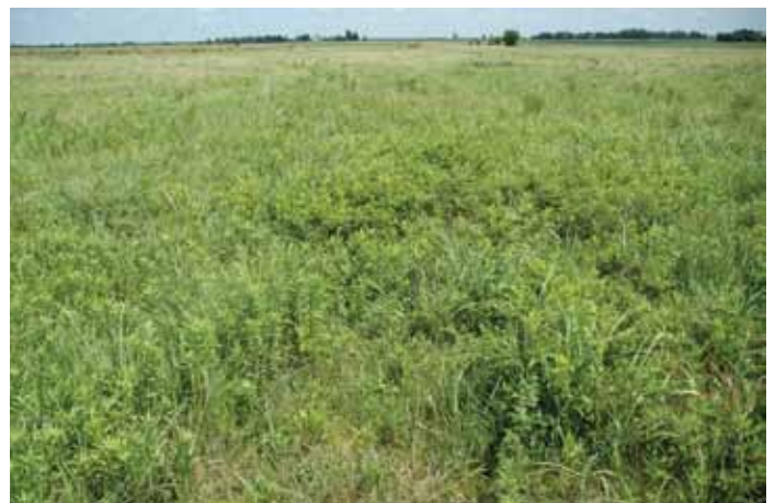
Figure 10. Grassland birds require open landscapes. Do not expect to find grassland birds using small fields in areas dominated by forest.

No discussion of grasslands and associated wildlife would be complete without mentioning area requirements. Most grassland bird species require relatively large tracts of grasslands. Small fields in a landscape dominated by forest will not attract species such as eastern meadowlark and grasshopper sparrow, regardless of grass type or management. Field size also is influential. Henslow's sparrows and eastern meadowlarks may be found in relatively small fields (10-20 acres and larger), whereas grasshopper sparrows are found more often in larger