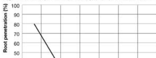
Figure 2. Root penetration and penetration resistance.

The readings taken with the penetrometer are called the cone index. The readings should be taken when the whole profile is at field capacity (approximately 24 hours after a soaking rain). The best time of the year for the compaction measurement is the spring because the whole profile has usually been