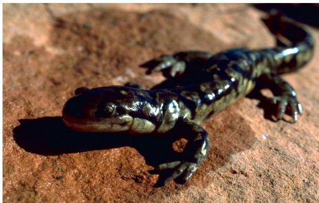
U. S. Fish and Wildlife Service

Fishless pools are ideal for amphibians because fish are efficient predators of amphibians. To benefit amphibians, minimize the chances of fish establishing themselves in a fishless pond by avoiding high-water connections with other water bodies that support fish. Ponds should have wide buffer strips to improve water quality and provide post-breeding habitat. Access by domestic livestock should be managed to reduce their impact, as intensive wading can disturb