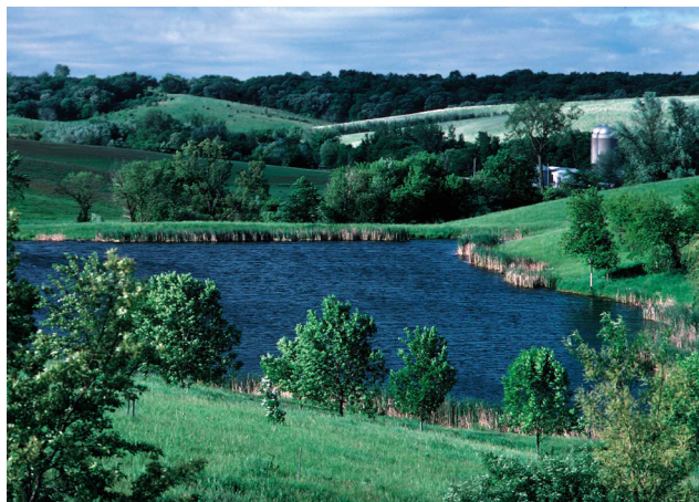
Farm pond in Jasper County, Iowa

This leaflet is designed to serve as an introduction to farm pond ecology and management. Farm pond ecology is reviewed and followed by an outline of habitat needs for various pond species. It discusses farm pond management and provides a list of landowner assistance programs. For information on pond planning, design, and construction, readers should consult the Natural Resources Conservation Service's (NRCS) Agricultural Handbook Number 590: Ponds – Planning, Design, Construction, available at ftp://ftp.wcc.nrcs.usda.gov/downloads/hydrology_hydraulics/