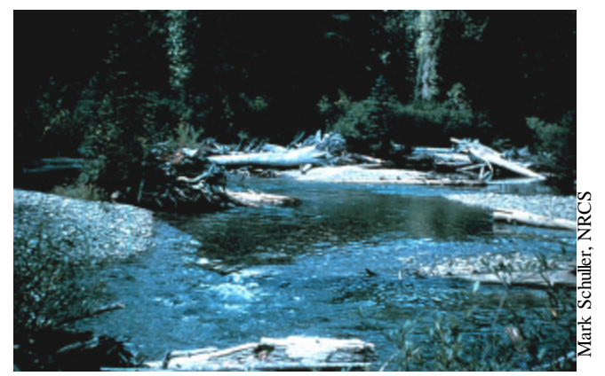
Steelhead habitat of interspersed pools and riffles, in-stream wood, and clean gravels.

Ideal interspersion of habitats within a trout stream consists of a complex of cool, clean water; undercut banks with overhanging riparian vegetation; slow-flowing shallow to deep pools; riffles in rapid-flowing water; one to three-inch diameter gravels or pebbles; aquatic weed beds; and submerged or semi-submerged logs or branches, rock piles and root masses that provide shelter. Because rainbow trout are more solitary than social in nature, an abundance of complex habitats partitions and reduces the size of territories, allowing more trout to coexist. In areas of extreme winter conditions, deep pools