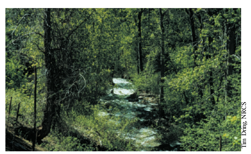
Riparian vegetation provides shade and organic matter to the stream and helps maintain stable steambanks.

In severely degraded stream habitats, adding physical structure can influence the development of scour holes, pools, narrowed stream channels, and increased water velocity of the stream. Additions of wood or boulders and planting of riparian vegetation can expedite an increase in overhanging bank cover and submerged habitat components that provide spawning, feeding, and hiding cover for rainbow trout. Instream improvements should always be designed to emulate the historical or desired ecological conditions of the