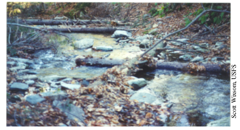
"Downstream V" current deflectors can be used to increase stream channel complexity in degraded streams.

In-stream wood -- Adding large wood to streams where little or no wood exists because of logging or poor retention capacity can increase pool area and provide cover for trout, especially in low-gradient channels with mobile substrates (see Hilderbrand et al. 1997). In forested streams, logs provide resting and hiding cover for rainbow trout and can be imported from outside of the riparian zone and placed in the stream channel. In more stable streams, untrimmed