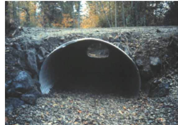
Well-designed culverts allow trout to move upstream and downstream.

Current deflectors – In seriously degraded streams, deflectors alter the course of shallow streams and concentrate flow to create deeper channels, scour pools and increase the diversity of current velocities. Log deflectors are generally V-shaped and are constructed on the stream edge with the closed end waterside. Both free ends are anchored in the stream bank at least three feet, and three- to four-foot lengths of rebar is used to fasten the in-stream logs to the stream bottom and to one another. Boulder and cobble fill is used to fill the deflector and stabilize it and the stream bank. Deflectors made solely of stone can be used as well. Bank cover logs installed opposite deflectors are necessary to protect the bank into which the redirected water is forced. Deflectors should only be used in channels of low habitat diversity where pools are limited, and watershed conditions warrant their use.