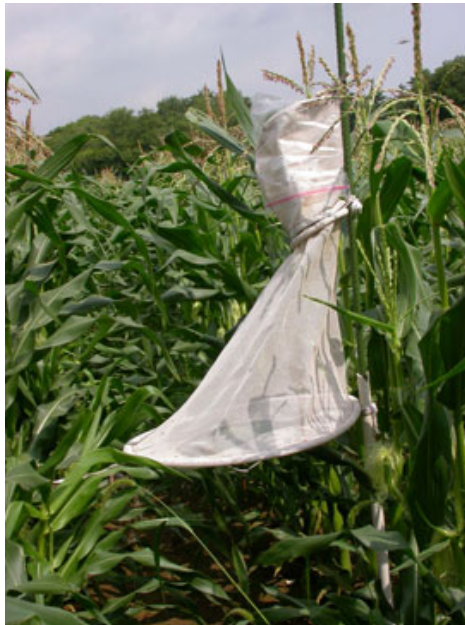
Photo B. Heliothis net trap with corn earworm (CEW) lure in silking sweet corn for monitoring arrival and population of CEW. Note that the base of the trap, where the lure hangs, is at the level of the corn silks. Because of the very heavy moth pressure at this site (>50 moths per week), counting was made easier by covering top with plastic bag and inserting a vapor strip.

traps baited with corn earworm lures can be used. Blacklight traps can be placed near corn fields, but not necessarily in them, and give a reasonable estimate of populations up to one mile away from fields. Traps should be checked daily, and capture of any corn earworm moths should trigger treatment [1]. The pheromone trap should be placed in freshly silking corn with the lure at ear height (photo B). Lures are suspended in an opening at the base of the trap and replaced every two weeks. Two traps per field, at least