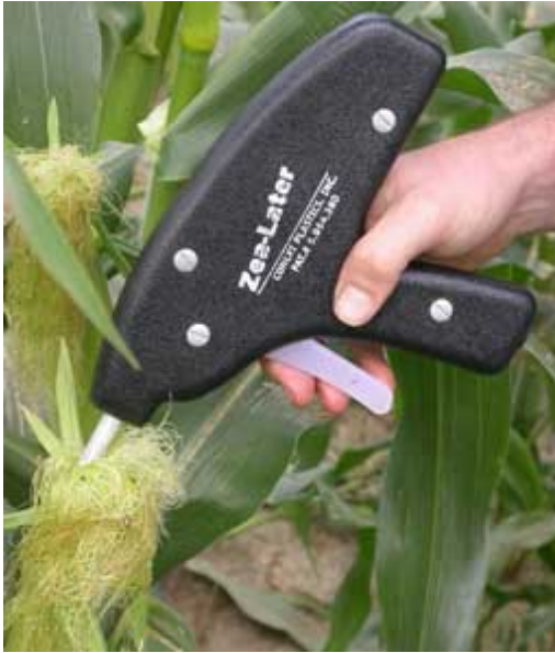
Photo C. Zea-later oil applicator being used to apply oil/ Bt treatment to corn silk.

tiveness of this material under a range of corn earworm pressures and spray intervals. Growers who would like to use this method should refer to existing publications on sprayer design and spray coverage for effective control of corn earworm [1, 9].