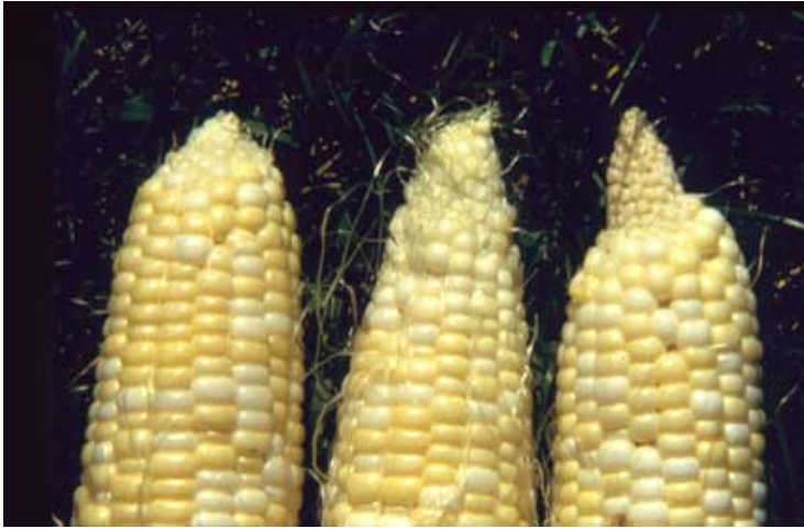
Photo D. Sample of corn ears at harvest. Ear on right has cone-tip from oil application. The other two were not treated with oil; the tip fill of the center ear is incomplete, a condition that occurs in some varieties or under certain environmental conditions. Oil application does not always result in cone-tip.

Applications made earlier than five days after silk do not appear to give better control and may result in a higher rate of “cone” tips (photo D). Cone tip develops when oil interferes with pollination of the silks that are attached to the tip of the ear, which are the last silks to develop. This results in unfilled kernels in the last half-inch of the tip. While partially-filled tips are a relatively common occurrence in sweet corn, the lack of kernel growth caused by oil is more pronounced.