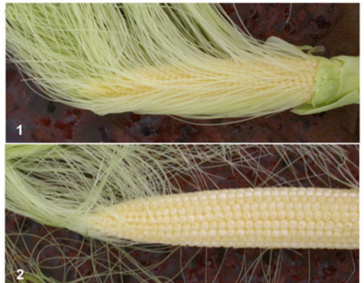
Photo E. De-husked corn ears during early silk. 1) Kernels have not been fertilized, ear is too young for oil treatment. 2) Only kernels at tip have not been fertilized. Oil should be applied at this stage.

Insecticides: Bacillus thuringiensis subsp. Kurstaki . Corn earworm larvae feed on silks as they move down the silk channel, then feed on the tip of the ear. Early in ear devel-