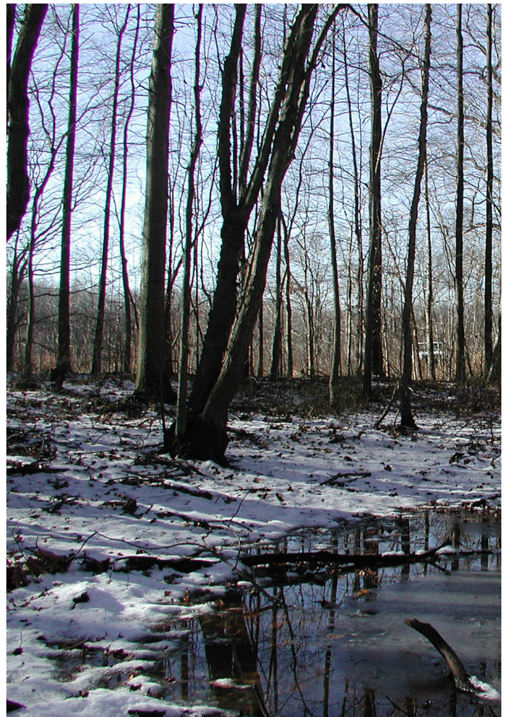
Most of Virginia's wetlands are open or forested and only seasonally saturated.

Call or visit your local USDA Service Center to determine whether these or other exemptions apply to your farm. Then, work through your NRCS office to submit a request for a required wetland determination.