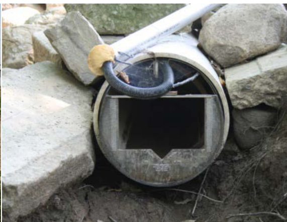
Figure 2: Subsurface tile drainage pipe with Thel-Mar compound weir.

The NRCS National Water Quality Specialist must review and approve system designs that fall outside of the typical system. Any designs submitted for review must include an analysis to show that the maximum acceptable uncertainty (Table 2) are not exceeded. Use the analysis method outlined by Harmel et. al. (2006a, 2009) (NEMI USDA HWQ1) .