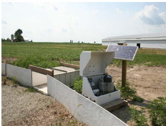
Figure 1: Edge-of-field surface runoff site with a 2.5 foot H-flume

e Enclosure such as a calf hut with a propane heater will likely be necessary for year round sampling in northern sites.