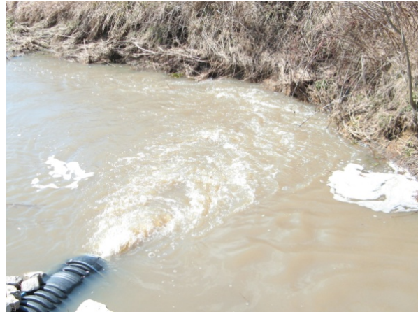
Figure 4: Edge-of-field tile with submergence.