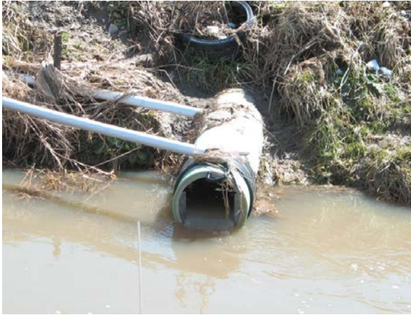
Figure 3: Edge-of-field tile with submergence.

An area velocity flow meter may be needed if frequent periods of submergence occur (Figure 3). If needed, the flow meter must be compatible with the automated sampler, which will serve as the electronic data logger to store velocity data. Area velocity meters typically use a pressure transducer and an ultrasonic sensor to measure water depth and velocity and are typically self-contained and resistant to interference from debris; therefore, they are appropriate for use in pipes or channels.