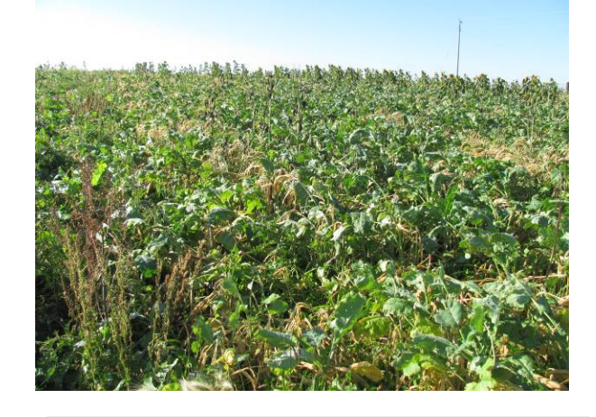
Warm / Full Season Cover Crop Mix, N. Dakota