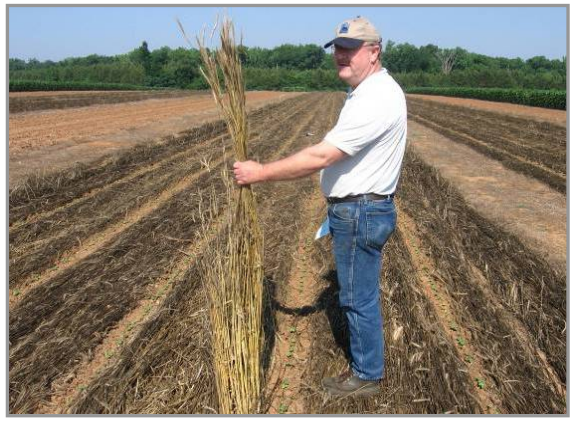
Cotton no-tilled into rolled rye cover crop, Alabama

Research from the Dakota Lakes Research Farm in Pierre, South Dakota in 2008 reports planting a mix of chickling vetch, lentils, and cowpeas (black-eyed peas). All three are legumes that fix atmospheric nitrogen, but they perform best at different times of the year. By October 15, this