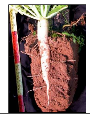
Forage radish used to relieve soil

Corn and potatoes are two important crops grown in the Pacific Northwest. Neither of these crops utilize large amounts of nitrogen late in development (Hammond, 1992; Thornton et al. 1997). Low utilization coupled with decomposition of postharvest residues can result in a large pool of residual nitrogen remaining in the soil. A 1993-1994 cover crop following sweet corn planted near Plymouth, WA, showed that the cover crops accumulated 29 to 125 lbs N/ac in the above-ground portion (Weinert et al., 1995). The cover crops were seeded in late August and were either allowed to over-winter or were incorporated in late fall. Spring incorporated cover crops that over-wintered accumulated between 100 and 125 lbs N/ac. Spring incorporation of the over-wintered cover crop maintained the nitrogen in the upper