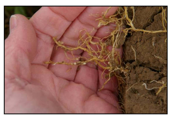
Rhizobium nodules on pea roots.

Legume crops fix atmospheric nitrogen into a form plants and microorganisms can use. In areas with nitrogen ground water problems, both legume and non-legume species can recycle existing soil nitrogen and reduce the risk of excess nitrogen leaching into ground water. Only particular strains of rhizobium provide optimum nitrogen production for each group of legumes.