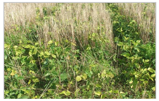
Cover crop mix (chickling vetch, lentils, cowpeas) no-tilled into wheat stubble

Researchers in Michigan have adopted a corn system that includes a 10-inch band herbicide treatment followed by two cultivations. Cover crops are over-seeded at the second cultivation of the corn crop. Several cover crop species have been successfully established using this technique, including crimson clover, mammoth red clover, annual ryegrass, hairy vetch and a 60 percent red clover / 40 percent sweet clover mixture. Timing is very important to successfully establish a cover crop by overseeding. It is extremely important to seed when there is enough light to germinate and establish the cover crop, yet late enough so it will not compete with the corn crop for water, nutrients or light. (Cavigelli, 1998).