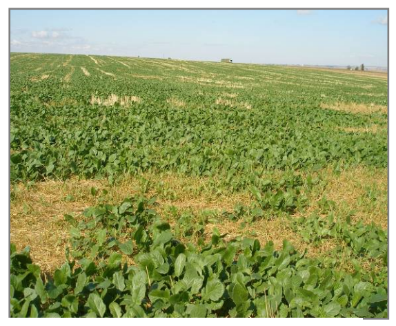
Fall planted mustard used as a biofumigant.