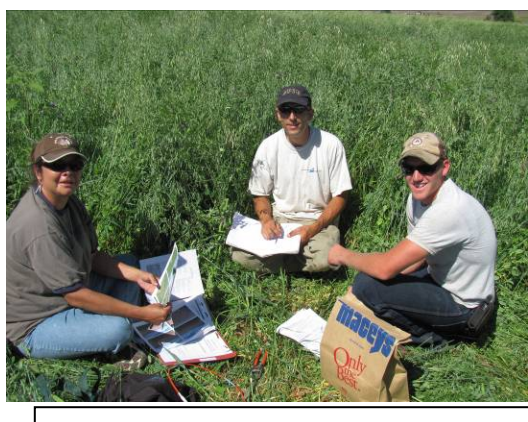
3 way mix, Peas, Vetch, Oats, Emmett, ID