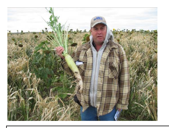
Warm / Full Season Cover Crop Mix, N. Dakota