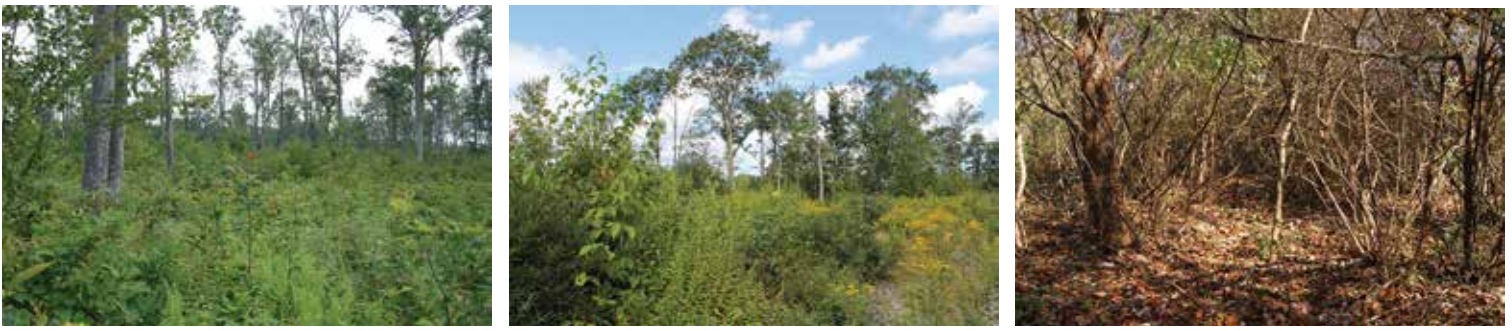
Figure 3. Examples of Golden-winged Warbler habitat (left and center photos) with a mix of residual trees, saplings, shrubs, and herbaceous cover and a harvested stand (right photo) where sapling regeneration has advanced beyond what is used by breeding Golden-winged Warblers.