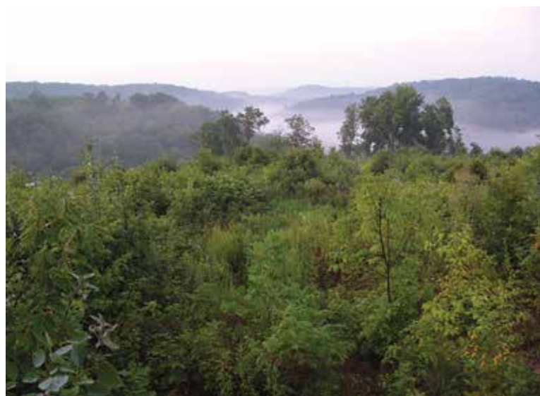
Figure 2. A highly forested landscape with young forest clustered throughout.