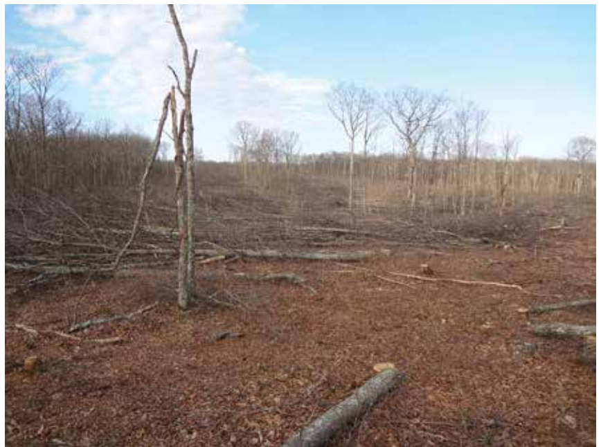
Figure 4. Retaining small groups of trees may reduce tree mortality from wind-throw.

Before and after harvest there are additional considerations for the manager including assessing the adequacy of the regeneration and light conditions, retaining seed sources, and controlling excessive deer browsing and undesirable competitive plants. Prescribed fire, brush-hogging, and additional treatments may enhance and extend the suitability of stands for Golden-winged Warbler.