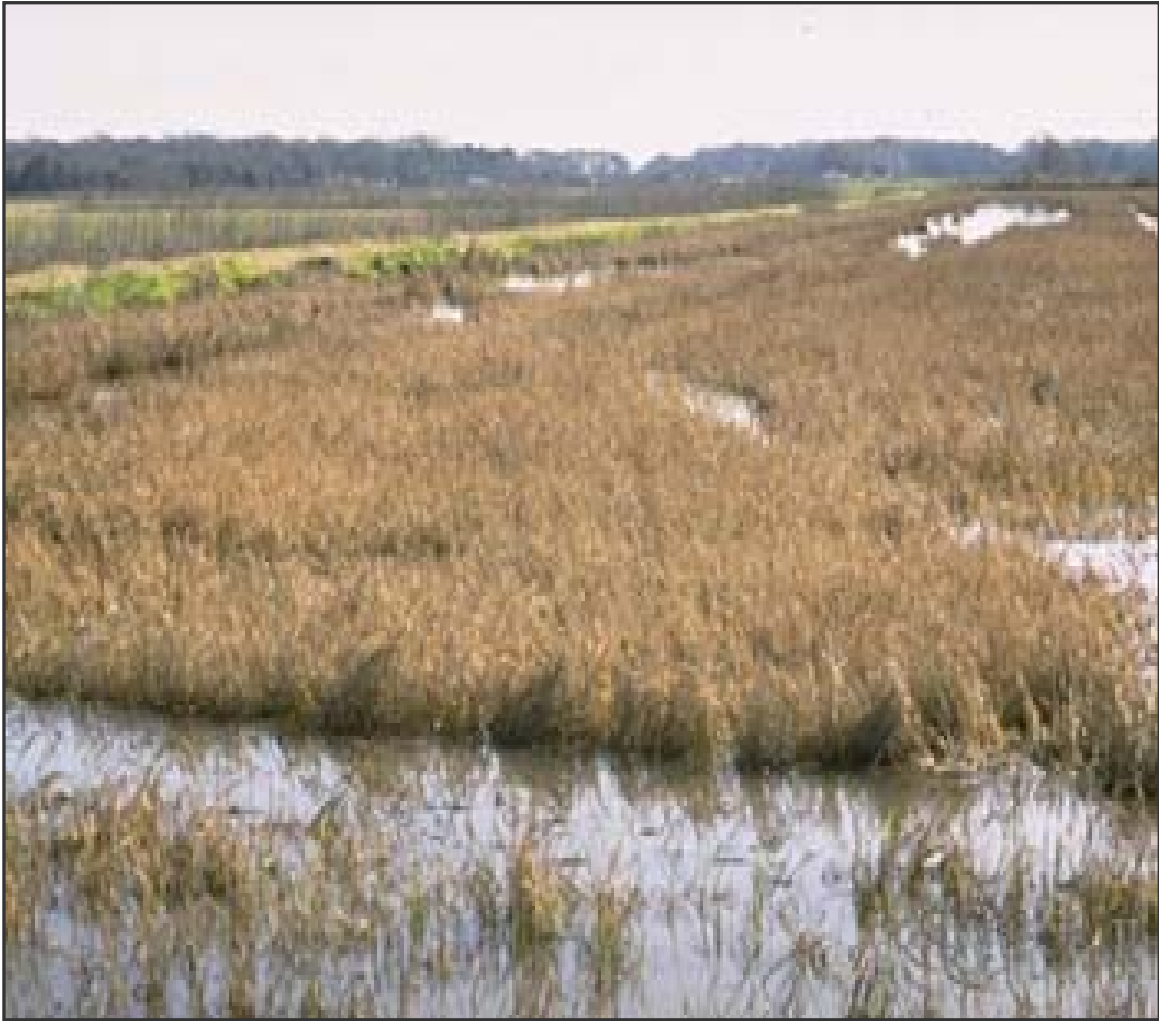
Figure 1. A crawfish pond.