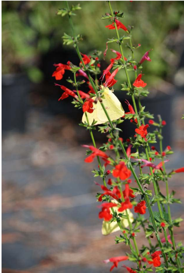
Clouded sulfur butterflies feeding on tropical sage ( Salvia coccinea )

Seed sold on a bulk pound basis may or may not