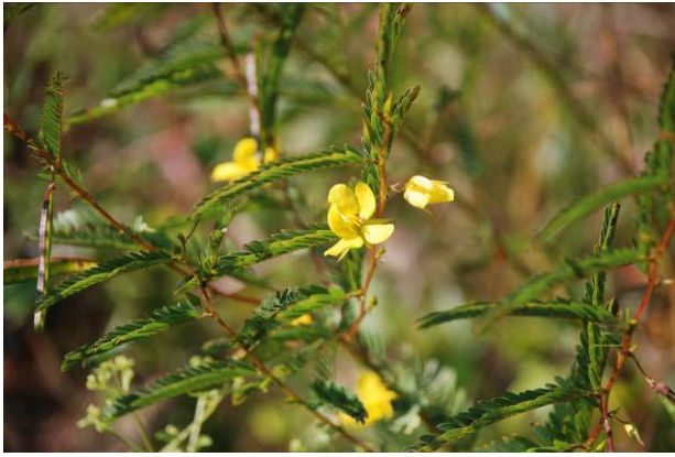
Partridge pea ( Chamaecrista fasciculata ) is a “buzz pollinated” species, meaning the pollen needs to be shaken out of the anthers by large bees such as bumblebees

Applying a thin (half inch or less) layer of weed and seed free straw or hay (straw from forages such as bahiagrass is typically not seed free) or mulch after cultipacking will also help prevent seed from being lost to seed predation or blown or washed away.