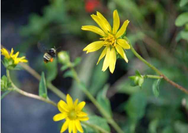
Native bee approaching starry rosinweed ( Silphium asteriscus ) flower

Insects make up 99% of the more than 200,000 species (e.g., insects, birds, and bats and other mammals) that act as pollinators. When most people think of insect pollinators, they think of bees, in particular honeybees, but certain types of flies, beetles, moths, and butterflies are also important. The common honeybee, a species introduced to North America by the European settlers, has been managed by humans for centuries for its pollination benefits, honey, and other products. In recent years, populations of the European honeybee have declined by over 50% worldwide due to diseases and pest. Because it was so easy to utilize European honeybees, the importance of native pollinators to North American ecosystems and agriculture has been overlooked. Studies have shown that adequate populations of native pollinator species, particularly native bee species, can provide 100% of the pollination activity needed for many farm crops. It has been estimated that wild, native bees pollinate over $3 billion worth of crops in the United States each year.