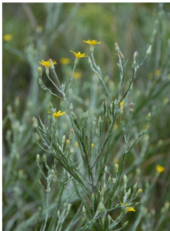
In one study in from South Florida, over 30 species of bees were found to visit narrowleaf silkgrass ( Pityopsis graminifolia )

( http://plants.usda.gov/pollinators/Using_Farm_Bill_Programs_for_Pollinator_Conservation.pdf )