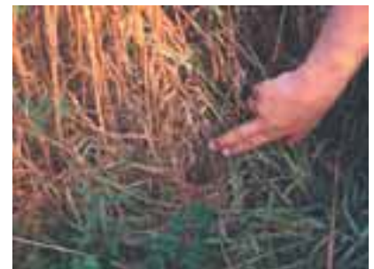
Bobwhite quail nest situated at the base of a 2-year-old bunch of broomsedge. Note how the senescent leaves from last year are used to construct the nest.