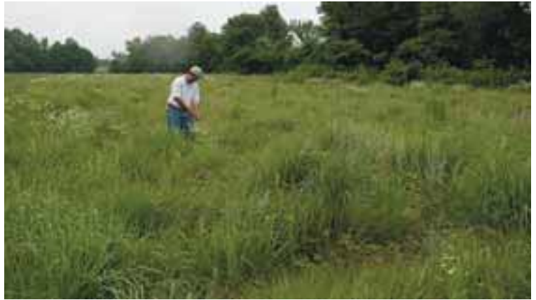
Short mixtures of nwsg usually are dominated by little bluestem, broomsedge and/or sideoats grama. These stands can provide excellent cover for nesting, brooding and foraging.

Species and mixtures for livestock forage are generally determined by preference and potential problems with competitive weeds. For example, pure stands of switchgrass or eastern gamagrass can provide excellent forage for livestock. However, if crabgrass and/or johnsongrass are prevalent, a mixture of big and little bluestem and indiangrass might be a better choice, because an imazapic herbicide can be used to help ensure successful establishment.