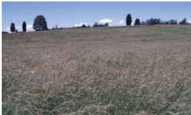
Fields of tall fescue are common throughout the Mid-South. This is poor wildlife habitat and, for many species, it might as well be covered in asphalt.

There are many problems associated with tall fescue and other perennial cool-season grasses, both for wildlife and livestock. Problems for livestock are associated with an endophyte fungus found within tall fescue that is highly toxic. Cattle consuming tall fescue (either grazing or as hay) often experience poor weight gains, reduced conception rates, intolerance to heat, failure to shed the winter hair coat, elevated body temperature and loss of hooves. Problems with horses are more severe, especially 60–90 days prior to foaling. Fescue toxicity in horses often leads to abortion, prolonged gestation, difficulty with birthing, thick placenta, foal deaths, retained placentas, reduced (or no) milk production and death of mares during foaling. As a forage, tall fescue and other perennial grasses (e.g., orchardgrass) are