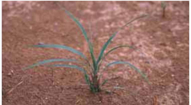
This is what you are looking for! This is a big bluestem seedling with its characteristic “fountain” appearance. Note the bare ground and lack of weeds germinating around the seedling. This is what should be expected from a properly applied pre-emergence herbicide.

Nwsg develop relatively slowly during the year of establishment. Most of the first-year plant growth is root development. Leaf and stem growth may not reach more than 2 feet high by the end of the first growing season. Typically, it is not until the second growing season that most nwsg develop considerable aboveground biomass, flower and produce seed. However, if the correct planting procedures are followed and soil moisture is not limiting, excellent growth will occur during the year of establishment, with considerable aboveground biomass and extensive flowering.