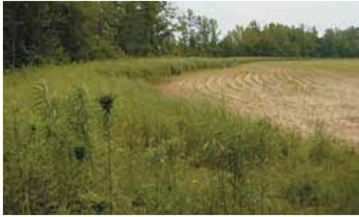
Establishing nwsg borders (>30 feet wide) can provide excellent nesting, brooding and escape cover around fields. Using this practice alone will help increase local populations of quail and various songbirds.

Nwsg can provide excellent forage for livestock and, when properly managed, can still provide quality nesting and brood-rearing habitat. Nwsg are attractive as a forage crop because nwsg produce the majority of their growth during the summer, when cool-season grasses produce relatively little. Yields of two to five tons per acre of nwsg forage can be expected, depending on rainfall, soil type and other conditions. Crude protein can be as high as 16–17 percent, but normally is 8–12 percent at optimum harvest. Just as with any forage species, nutrient content of nwsg is influenced by plant maturity. As plants mature, percent protein and digestible energy decrease, while fiber content increases. Maximum tonnage and high forage quality do not occur at the same time. From a practical standpoint, all grass hay should be cut just before seedheads begin to emerge, whether warm- or cool-season.