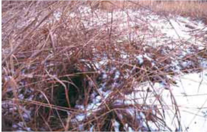
Taller nwsg species (e.g., big bluestem, indiagrass and switchgrass) provide excellent cover in winter because their stems “lodge,” creating usable space for wildlife. Here, a rabbit finds a winter home. This type of structure is not available in cool-season grass fields.

is at a premium. Tall nwsg, such as big bluestem, indiagrass and switchgrass, are especially valuable as their stems “lodge” (remain somewhat upright, leaning against each other), continuing to provide cover even after winter rains, snow and wind. Deer seek out nwsg fields on cold, clear days because they can remain hidden in the tall grasses, yet are able to absorb the sun’s warm rays. In low-lying bottomlands that periodically flood in winter, fields of switchgrass (especially the Kanlow variety) can attract large numbers of ducks when shallowly flooded.