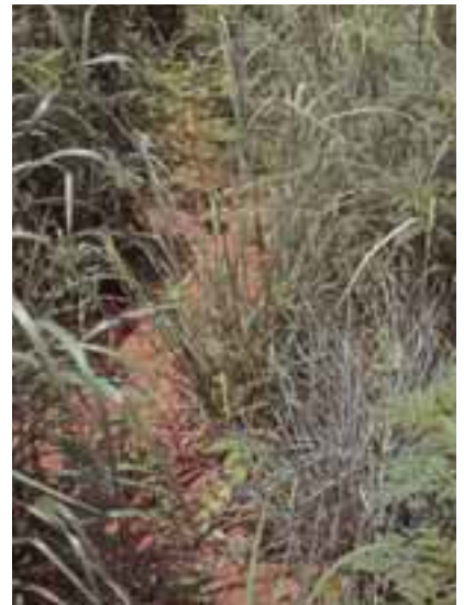
This is what a field planted for wildlife should look like in early June. Sparse nwsg, abundant forbs (ragweed, partridge pea) and open ground space provide the optimum structure for brooding and a seed source for fall and winter.

An open structure at ground level also enables the seedbank (seed in the top few inches of soil) to germinate. Arising from the seedbank are plants such as ragweed, blackberry, partridge pea, beggar’s-lice, pokeweed, native lespedezas and annual sunflowers. Forb cover is critical in making a field of nwsg most attractive to wildlife. These plants provide an excellent canopy of brood-rearing cover for quail and wild turkeys; quality forage for deer, rabbits and groundhogs; and later produce seed and soft mast that is an important source of energy through summer and into fall and winter for many wildlife species. Scattered brush and small trees also can make a field of nwsg and associated forbs more attractive to wildlife, particularly bobwhites and several spe-