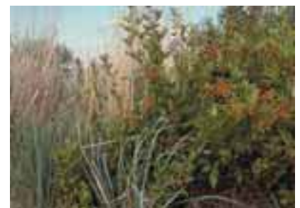
Forbs (e.g., blackberries, partridge pea and ragweed) provide excellent brooding cover and a source of seed for bobwhites and other species.