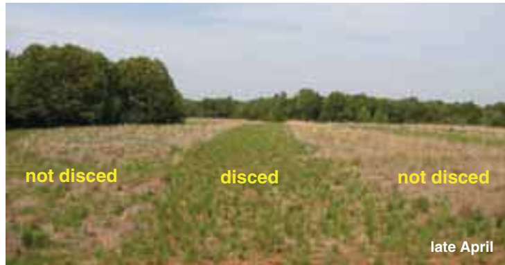
This field is being managed by discing alternate strips in winter. This will provide brooding cover adjacent to nesting cover.

Another management practice often necessary is herbicide applications. Strip spraying a grass-selective herbicide (e.g., Select ® ) in late April using alternate spray nozzles can decrease grass density, create additional open space at ground level and stimulate the seedbank. Strip spraying should be conducted in patterns similar to those recommended for discing. Spot spraying or broadcast spraying other selective herbicides (see Appendix 1) may be necessary to reduce several problem grasses (e.g., crabgrass, tall fescue) and forbs (e.g., sericea lespedeza, thistles), as well as woody competition (e.g., sweetgum, winged elm). In all cases, herbicide labels should be read before use and followed closely with regard to restrictions, precautions, rates, recommended tank mixtures, surfactants and sprayer-cleaning recommendations.