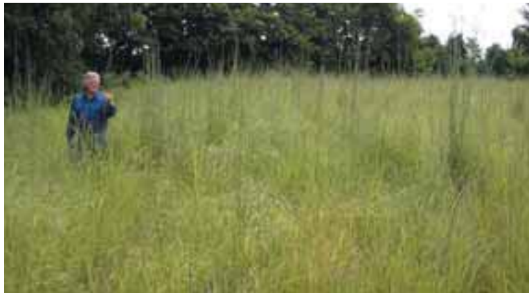
Tall mixtures of nwsgr usually include some combination of big bluestem, indiagrass and switchgrass. These stands can provide excellent cover for nesting, brooding and foraging, as well as winter and escape cover.

Tall mixtures provide cover for ground-nesting birds, as well as those that nest above-ground (e.g., dickcissel, field sparrow, Henslow's sparrow and red-winged blackbird). Tall mixtures also provide excellent cover for brood rearing and escaping predators.